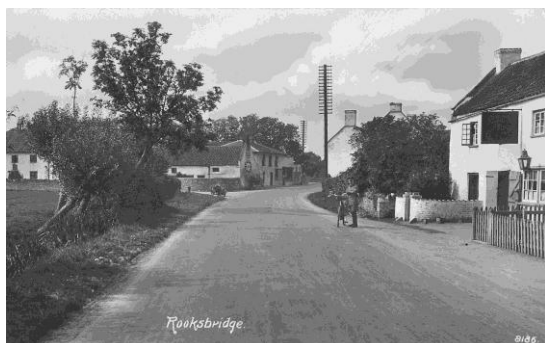
EBPHG Meeting 051212 plus Jan 2013 (rev 1)

An example of changes in the Parish are in the two photos below. These are taken from virtually the same spot on the A38 in Rooksbridge with the Wellington Arms on the right. The earlier photo was taken in 1922 before the road was widened and straightened in 1926. The Chapel of the Good Shepherd with its bell on the roof is evident on the mid-left and is it a Postman or AA man outside the "Welly" – does anyone know? In the mid-distance is a shop front (Saddlers/General Store) did it sell BP fuel as it looks like a BP sign at the end of Gill Lane. The later photo was taken at the end of 2012.